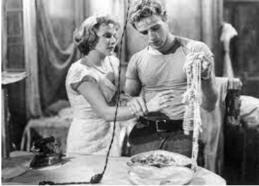
Still from Elia Kazan's Oscar-winning adaptation of Tennessee William's Pulitzer Prize-winning 1947 play 'A Streetcar Named Desire'

'The Metaphysical Poets' "The most heterogeneous ideas are yoked by violence together" - Samuel Jonson