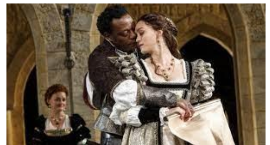
Still from an adaptation of Shakespeare's tragedy 'Othello', known for its enduring themes of passion, jealousy and race

The English department is always very busy with extracurricular activities like visits to universities, events in school like the Literary Festival, master classes led by academics and so on. There are also many Leadership opportunities like becoming Subject Leaders and leading the English Society.