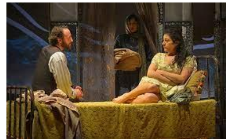
Image from an adaptation of Khaled Hosseini's compelling novel 'A Thousand Splendid Suns': a breath-taking story set against the volatile events of Afghanistan's last thirty years